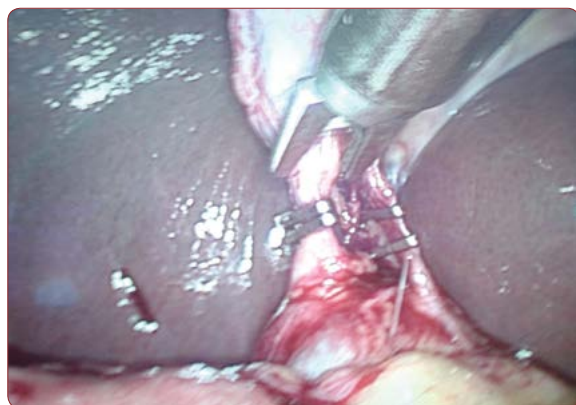
FIGURE 3. Gross operative section revealed clipping the cystic duct and artery with the clip applicator (marked with arrow)

No major differences were seen between groups in terms of inpatient stay, postoperative complications and safety of the procedure. Hospital stay in both groups was similar (two to three days). Ryle's tube was removed in the evening on the same day of surgery. Next day, patients were allowed oral sips of water and by the evening full diet. From the moment patients started taking orally, they were discharged after 48 hours. In four cases, the hospital stay was three to four days. All patients were observed for any fever, wound infection, bleeding, intra-abdominal col-