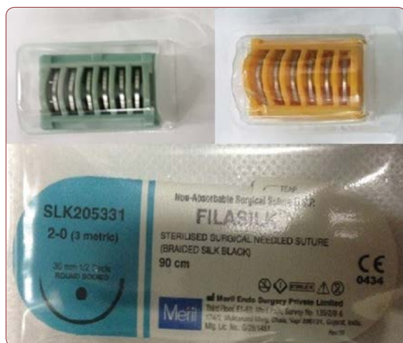
FIGURE 1. Material used for ligating and clipping the cystic duct and artery

sea, nausea associated with vomiting in 21 (35%) cases, along with occasional episodes of pain as the second most common symptom. Sixteen (26.67%) patients had dyspepsia with pain on and off. None of the patients presented with fever or jaundice. The cases were randomly allocated by a sealed envelope method into the study group A (70 cases) and the control group B (70 cases), and 20 patients were excluded from the study. All cases included in this study were diagnosed as having chronic cholecystitis with cholelithiasis. Excluded patients presented acute cholecystitis, empyema gallbladder, disarranged coagulation profile, pregnancy, etc.